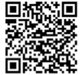
Scan for more information