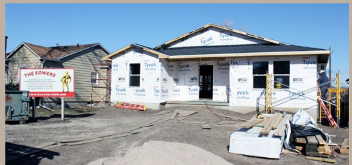
Lincoln Northeast High School students are building a home for a family in need at 5010 Starr St.

Once the house is completed, it will be sold to an eligible family involved with LHA. The price hasn't been set, but interested LHA families can determine their eligibility to purchase the house or take advantage of a lease-to-purchase contract by contacting Susan Tatum at SusanT@L-housing.com. Applicants are encouraged to take homeownership preparation classes through NeighborWorks at https://nwlincoln.org/the-work/homeownership/education.html .